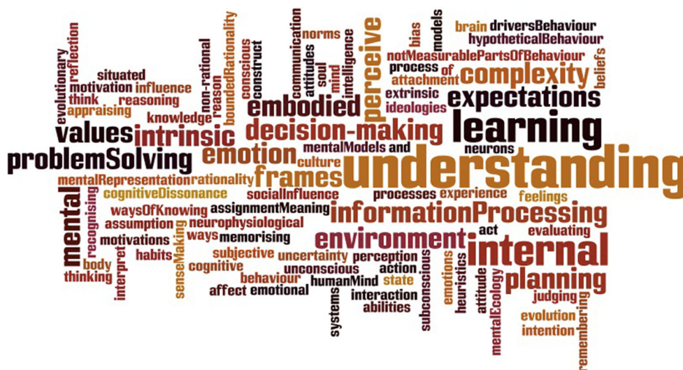
Fig. 2 Brainstorming result on what SES researchers at Stockholm Resilience Centre associate with cognition

straightforward and highly debated. Yet, dealing with these issues is crucial for being able to refine and clarify the object of investigation in terms of research scope and focus (e.g. brain, body and/or environment) based on different paradigms and related conceptions of cognition.